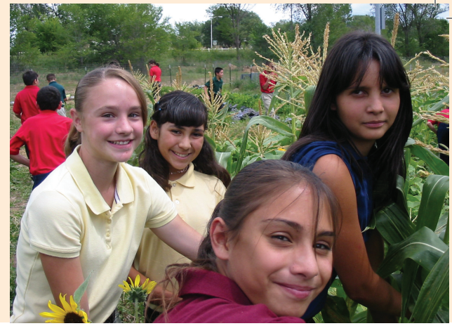
The Memorial Middle School Agricultural Extension and Education Center (MMSAEEC) helps prepare youth for careers in the sciences, including agriculture and natural resource sciences.

Students learn about agriculture through hands-on experiences.