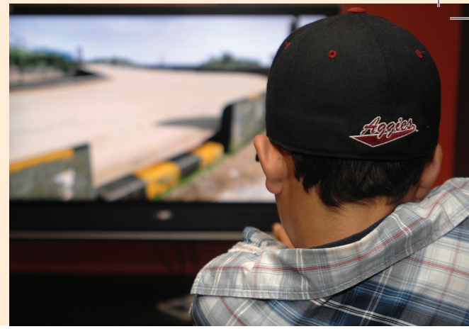
The NMSU Learning Games Lab develops games that make learning an experience, not just a test or a drill.

Creating research-based, educational games and media.