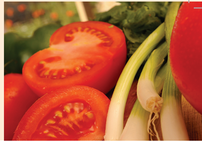
Kitchen Creations increases knowledge of healthy food choices and meal planning for people with diabetes.

Cooking school provides diet ideas and suggestions for people with diabetes.