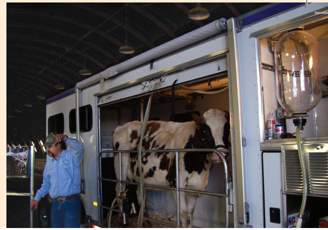
The Kids & Kows & More program shows students and teachers across New Mexico that agriculture is all around them, from the food they eat to the clothes they wear.

Students and teachers learn how food and fiber contribute to their health and well-being.