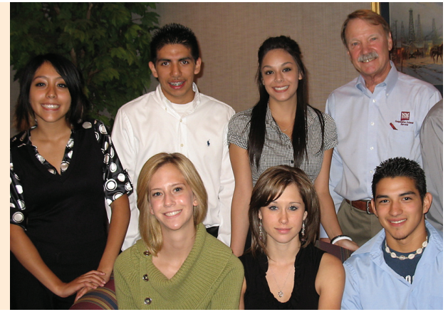
High school students interested in learning about entrepreneurship participate in NMSU's YES Camp. During the program, students create a business plan and research its economic feasibility.

Students learn financial strategy, market research and entrepreneurship.