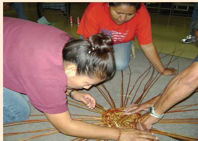
Navajo 4-H members participate in the Native American tradition of basket making during a 4-H Club activity.

Bringing together traditional teachings and Extension programs.