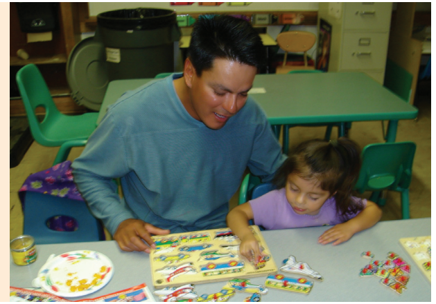
A father and child take part in a nurturing family activity during the Strengthening Families Initiative program.

Parents learn effective discipline skills and how to build healthy family relationships.