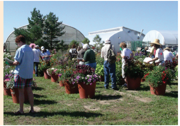
Volunteers in the master gardener program tour a container gardening demonstration. As part of the program, volunteers receive training to prepare them to answer questions and teach others.

The vast majority of people in New Mexico are connected to gardening in some way.