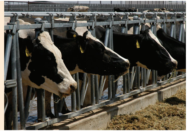
Dairy producers from across the nation prefer the favorable climate of the Southwest to milk their cows. Students in the Southern Great Plains Dairy Consortium can take advantage of this by getting hands-on experience at area dairies.

One mission of the consortium is to provide sound science to the dairy industry.